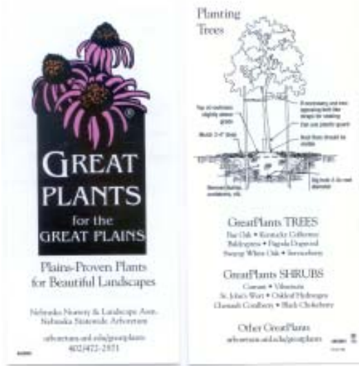
Tree planting bookmark