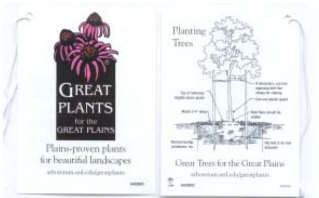
Tree Planting Hanging Tag plastic 3 x 4" ($10/100)

Bookmarks, plastic 2 3/4" x 6 1/8" ($30/100)